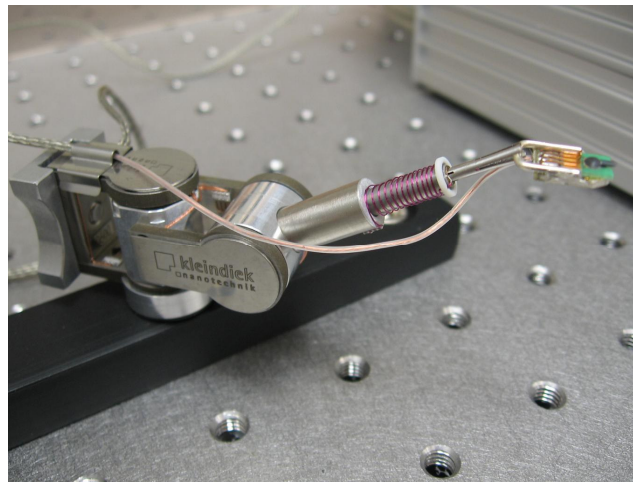
MM3A nanomanipulator at Clemson University, Smart Structures and NEMS Laboratory (SSNEMS).