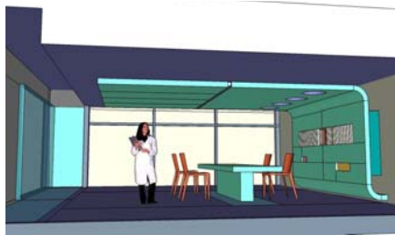
fig. 1: AWE concept - SLEEPING

This dramatic shift in the nature, place and organization of working life motivates our research which, in the simplest of terms, involves the designing, prototyping, demonstrating and evaluating of a prototypical “robot-room” with embedded Information Technologies that we call an “Animated Work Environment” [AWE] (figures 1 and 2).